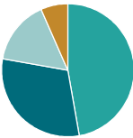
Allocation of underlying funds*