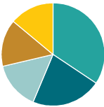
Allocation of underlying funds*